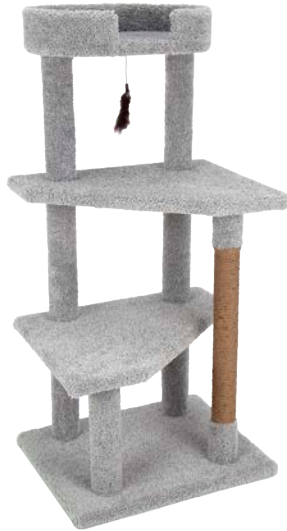
ASSEMBLED DIMENSIONS 24" X 20" X 49.5" (H)

• Vacuum your cat tree prior to initial use to remove any packaging debris.