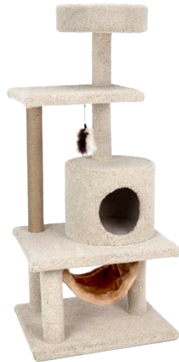
ASSEMBLED DIMENSIONS 24" X 20" X 55" (H)

• Vacuum your cat tree prior to initial use to remove any packaging debris.